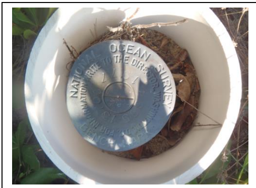
Monument: TIDAL C