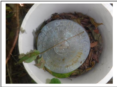
Monument: 1370 865 C TIDAL