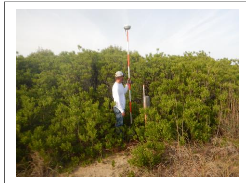
Location Verification: 1370 865 C TIDAL