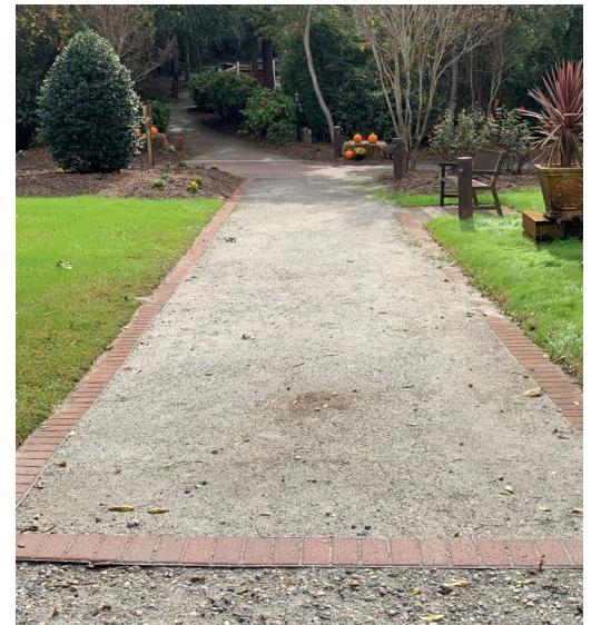
Future home of Memory Lane

A certificate acknowledging the engraved brick will be created and mailed.